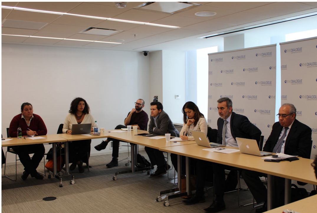
PARTICIPANTS IN THE PRIVATE ROUNDTABLE ON IMPROVING NATIONAL PROTECTION MECHANISMS

President Bolsonaro's demonization of precisely the groups protected by the Mechanism, including media workers, seriously undermines trust between those groups and the government.