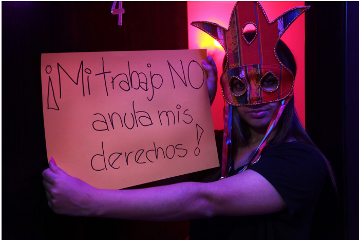
"MY JOB DOES NOT NEGATE MY RIGHTS!"