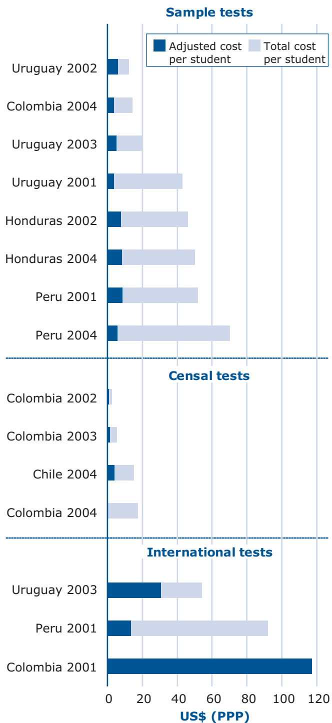
Figure 3: Cost and adjusted cost per student tested

NOTE: The adjusted cost per student was obtained by dividing the cost per student by the number of grades and subjects tested.