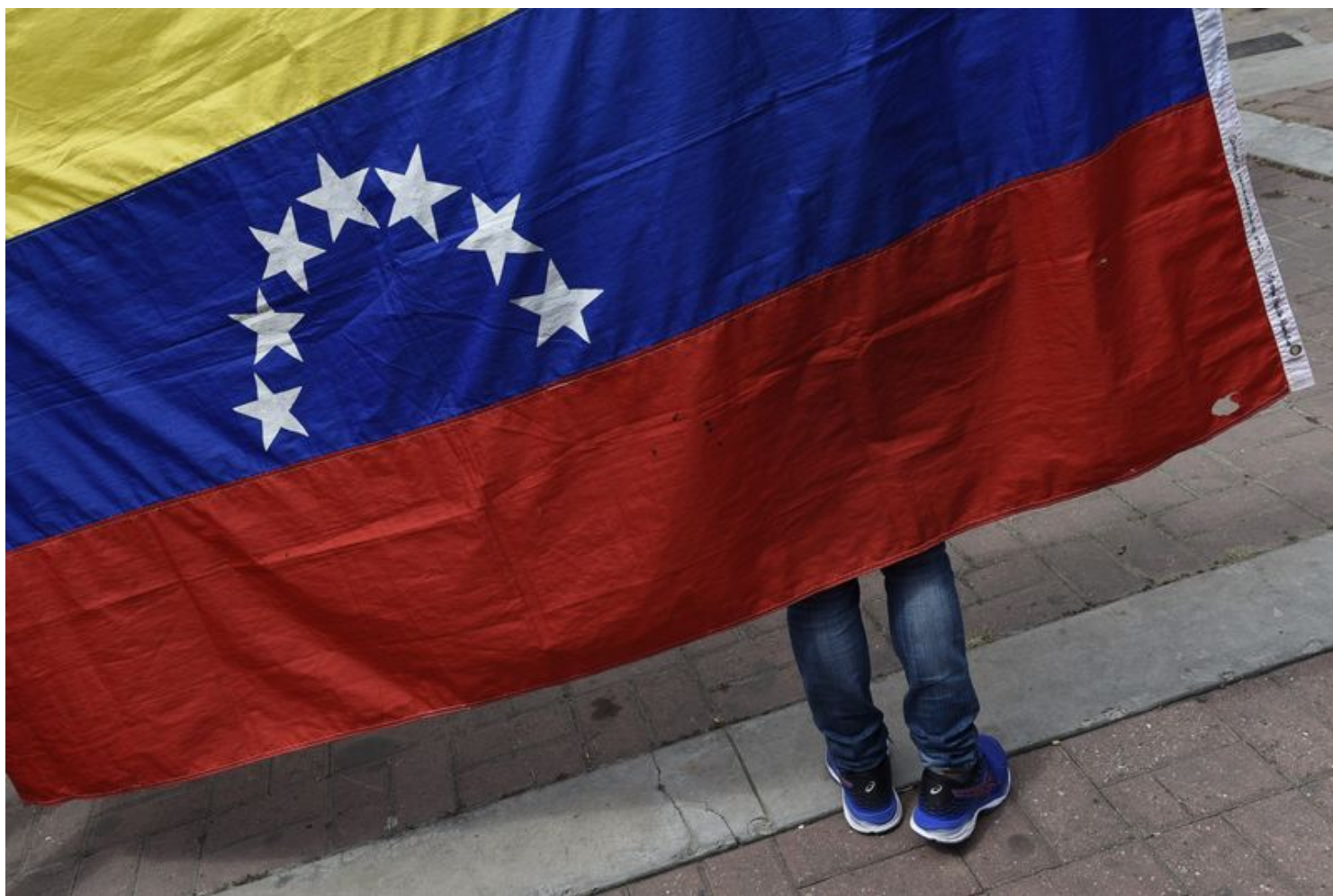
An attendee holds a Venezuelan flag in Caracas, Venezuela.