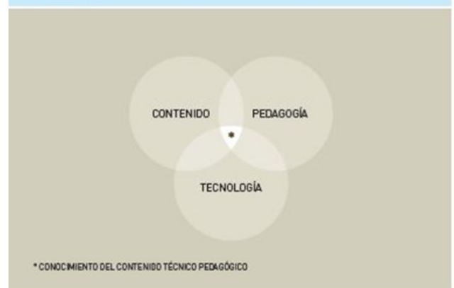
GRÁFICO 5.1 Contexto escolar

It becomes clear that past initiatives have not been sufficient. Training teachers in the plain use of ICTs, though a necessary component, is only the first step. For example, a study in Chile found that 53% of professors assert that they received a certification in basic ICT use, but only 31% reported to have taken a course on its pedagogical use, and only 11%